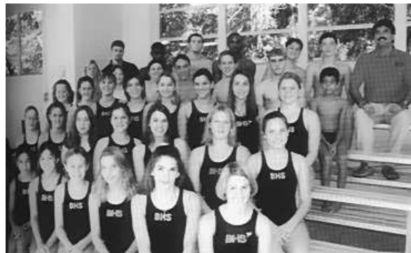
Championship Swim Team - 2001

Band Awards Boxing Trophy, date unknown Division 8 Cross Country Championship, Varsity Boys, Second Indians C Meet Champions